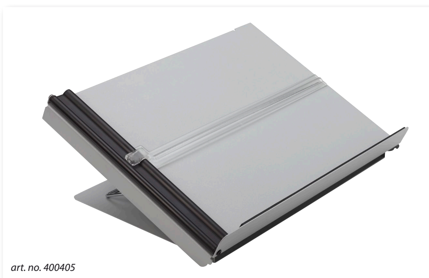
art. no. 400405

The construction is of heavy duty steel and painted with "matte" powder coating silver finish to avoid reflections.