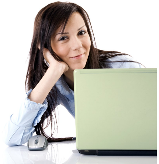
art. no. 105700