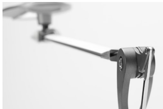
art. no. 105000