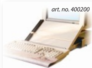
art. no. 400200